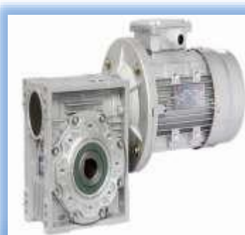
Motors & Gears